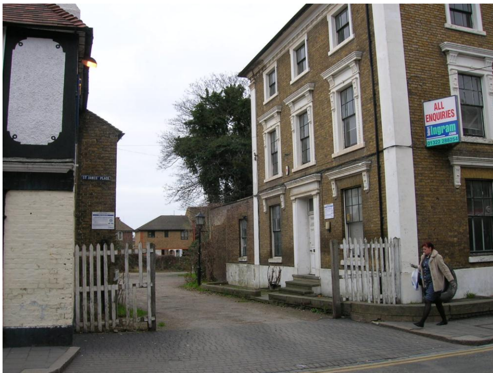
The access road to St James Place with the Royal Oak Inn on the left and 55 Spital Street on the right (2011)