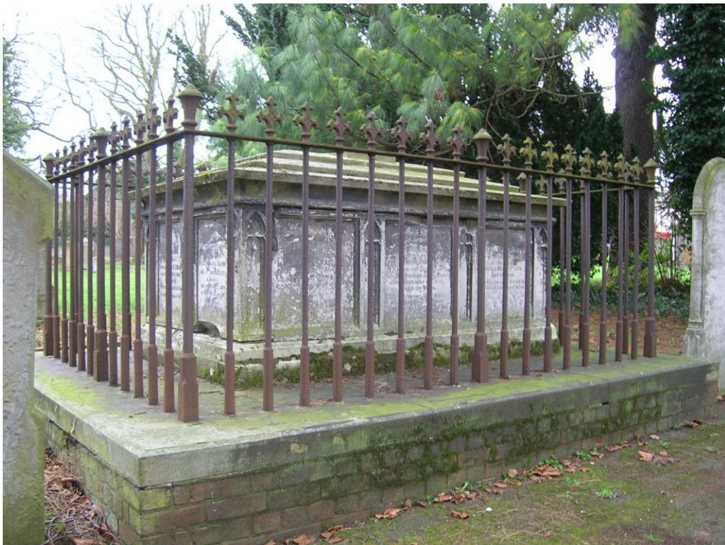
The Sanham family tomb in East Hill Cemetery (2011)

In / affectionate remembrance / of / ELIZA SANHAM, / youngest daughter of the late / JAMES SANHAM / who died Feb 20 th 1902 / aged 76 years. / “Though lost to sight to memory dear.”