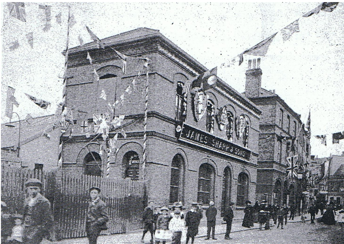
The offices of James Sharp & Sons in 1902