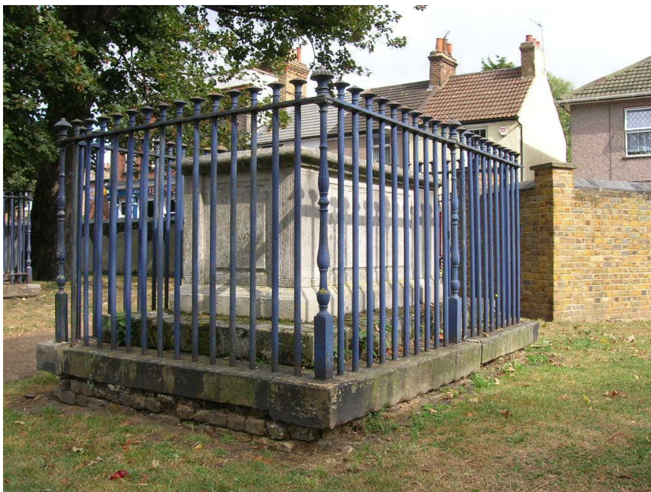
The Sharp family tomb