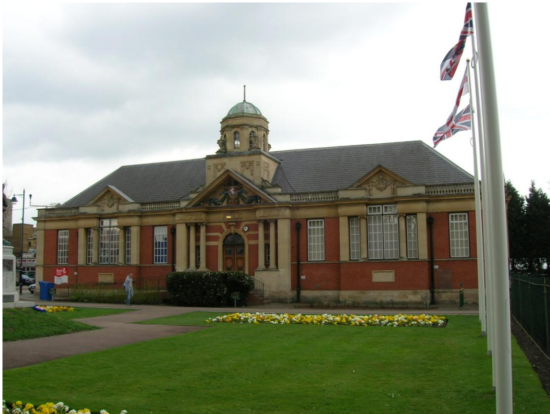
Dartford Library (2011)

Sunderland where he became ill and died of pneumonia in December 1932, aged 32 (unmarried) 3 .