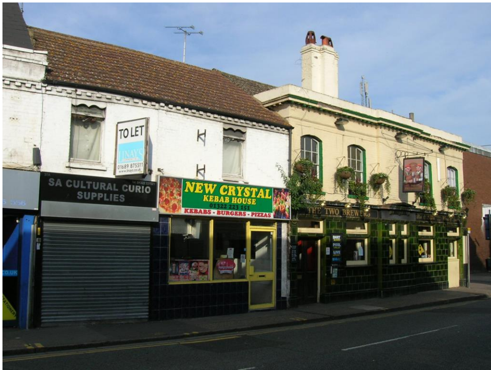
35 Lowfield Street (2011)