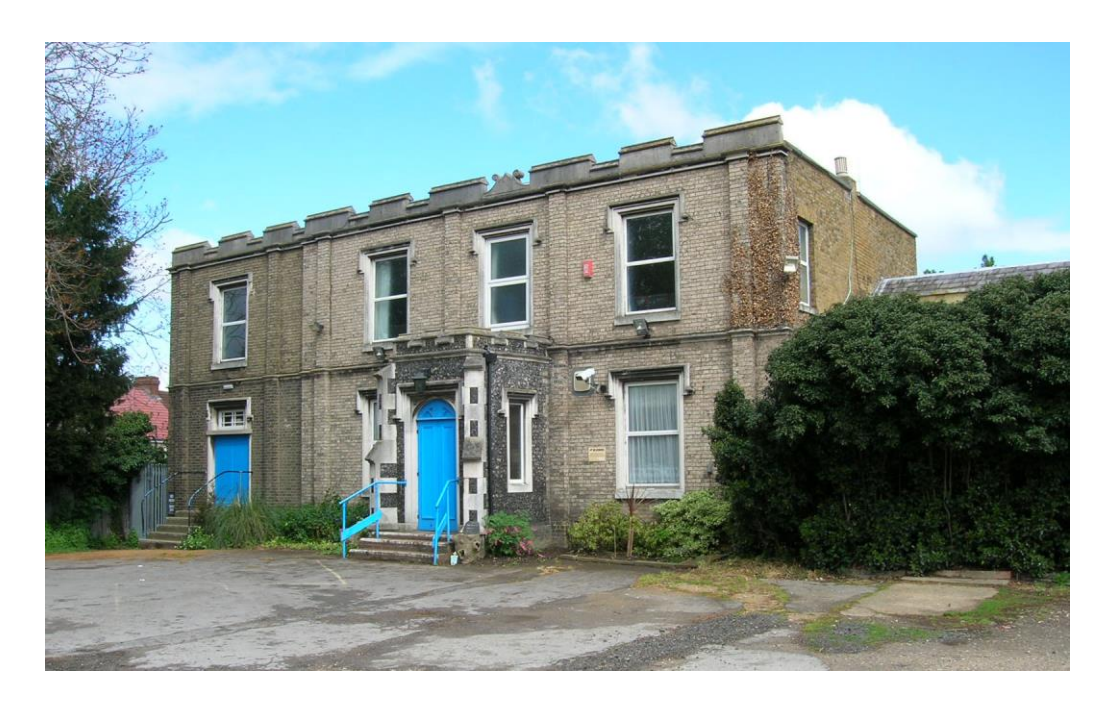
West Hill House, Dartford (2010)

cottages in Dartford. They included Hampden and Claremount Terraces, which flank the entrance to West Hill House. Also two rows of cottages called St Ronan's and The Crescent in Darenth Lane, near its junction with East Hill. Both no longer exist, St Ronan's was demolished in 1938.