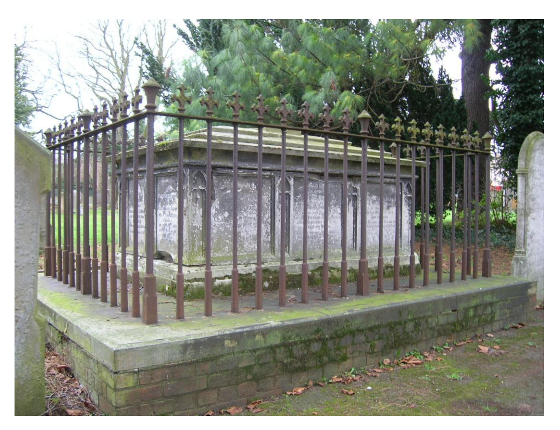
The Sanham family tomb in East Hill Cemetery (2011)

In / affectionate remembrance / of / ELIZA SANHAM, / youngest daughter of the late / JAMES SANHAM / who died Feb 20^{th} 1902 / aged 76 years. / "Though lost to sight to memory dear."