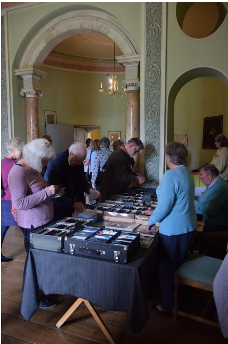
The popular vintage postcard stall