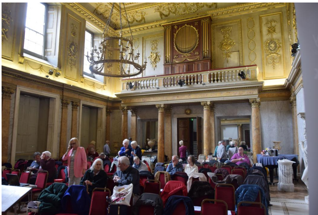
A general view of the hall.