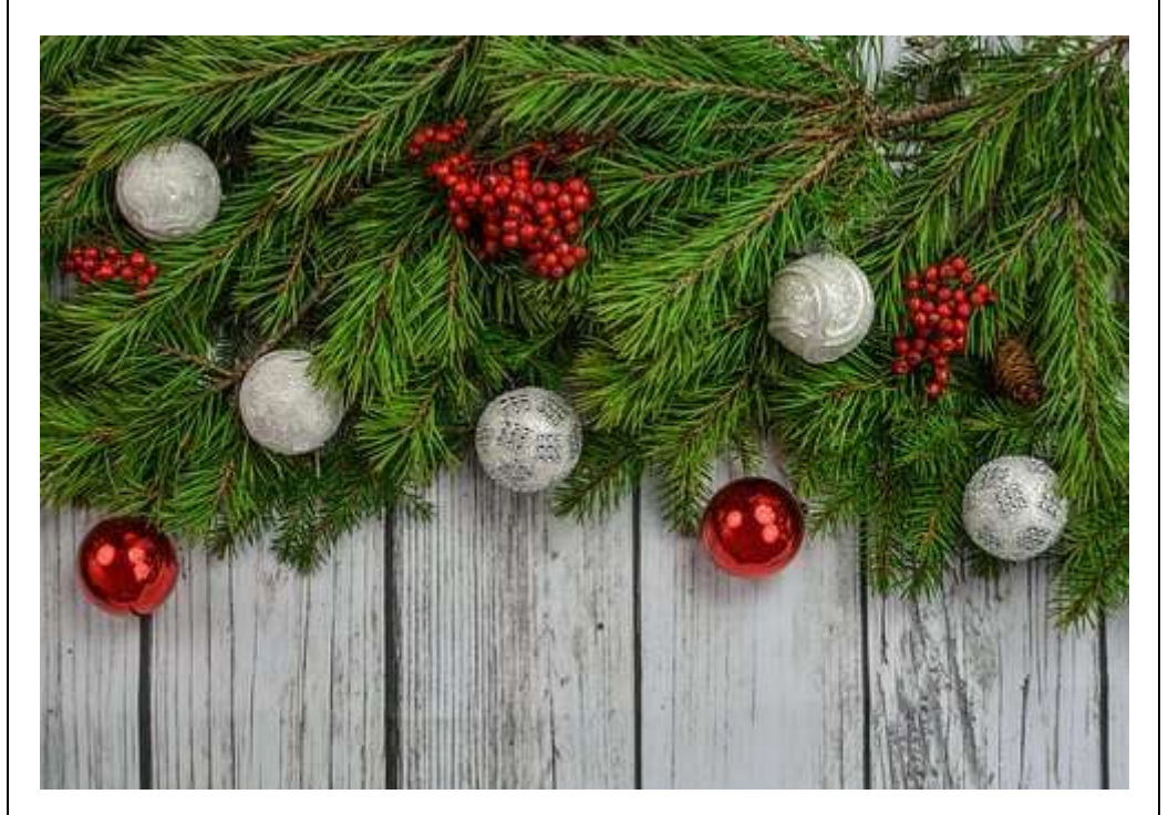
Welcome to the mid December enews.

As we approach our 2nd Covid dominated Christmas I hope you are looking forward in good health and an optimistic spirit. Best of luck with keeping to your New Year Resolutions. I will take a short break and the next enews will be January 2022.